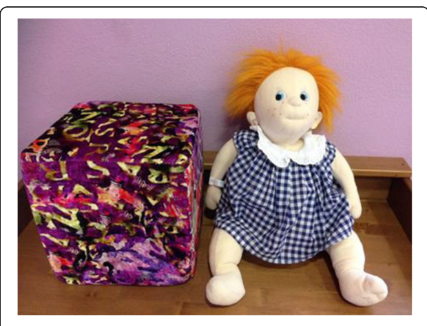
Fig. 2 The doll and the soft cube

The object (doll or cube) presentation procedure will be structured in five standard steps as follows: